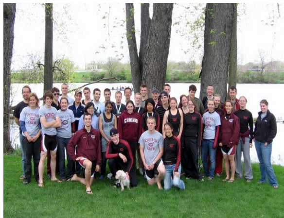
The Team at MACARAS