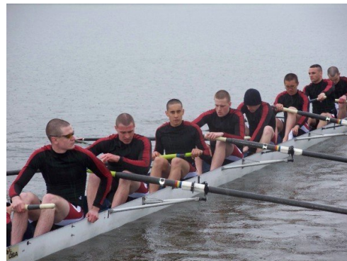
The Novice Men's 8+ getting ready to row