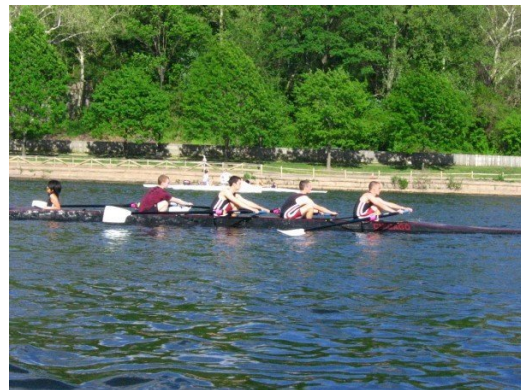
Varsity Men's 4+ at Dad Vails

As for the rest of our weekend, it was spent enjoying our wonderful hosts' food and hospitality, watching some amazing races, and vowing that we would never hear the words "third place" next year.