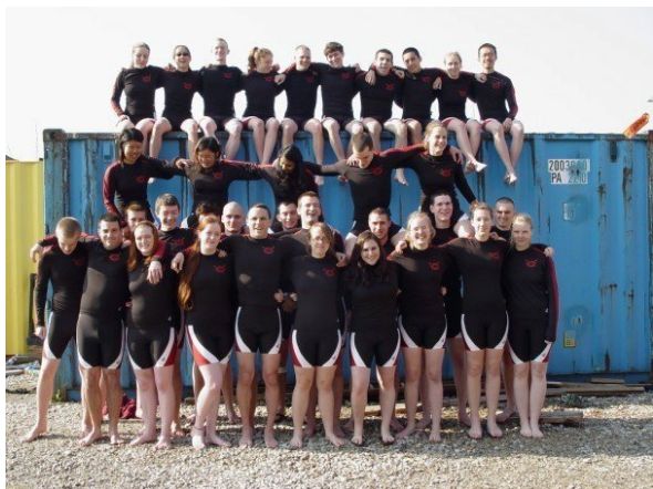
Team Picture

This past year has brought about immense change in the operation of the team and as a result, the athletes have a new sense of motivation and purpose. The team has literally been revitalized. I look forward to the team's continued growth and competitiveness, and thank all the alumni and parents who have supported the team this year.